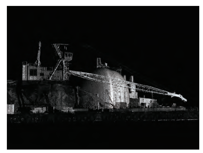
Lidar image of unloading facility