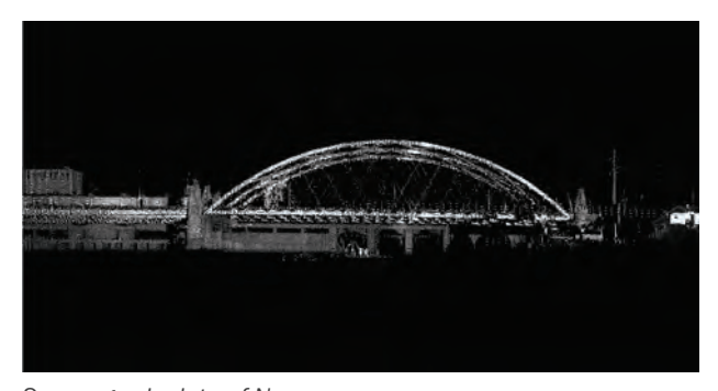
Survey-grade data of New Providence River bridge