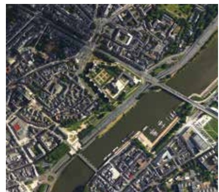
Seamlessly Integrated Cameras