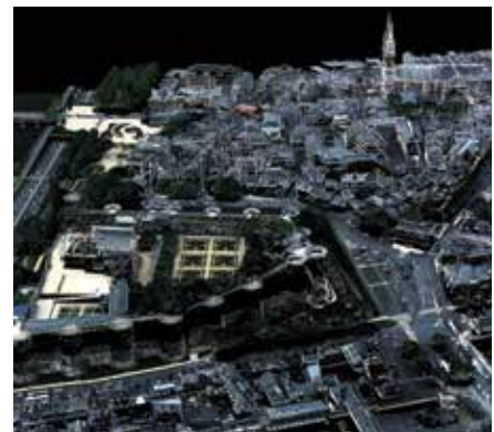
Increased Vertical Density